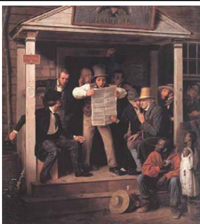
War news from Mexico