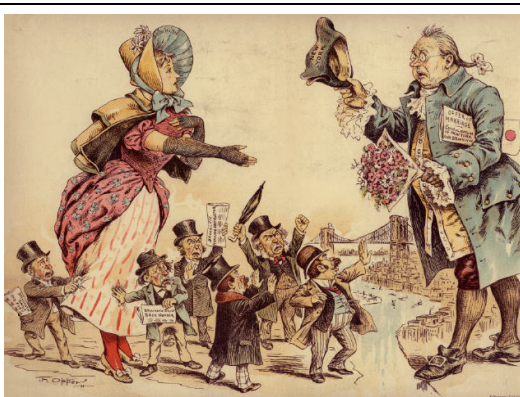
Brooklynites oppose the merger, 1894