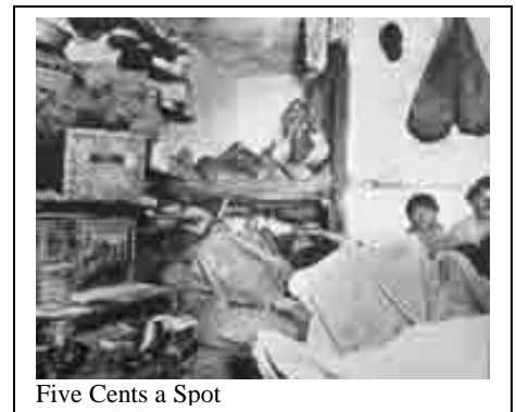
Five Cents a Spot