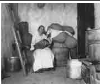
An Italian Ragpicker